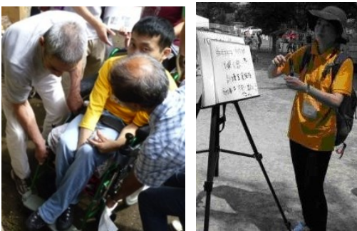
Left: Neighbors lifted the wheel chair up and down the stairs in the second year of a disaster drill. Right: Announcements were written down on a board for the deaf at a community disaster drill.

• Zurayata Project runs disaster preparedness group works and evacuation drills as a part of peer activities.