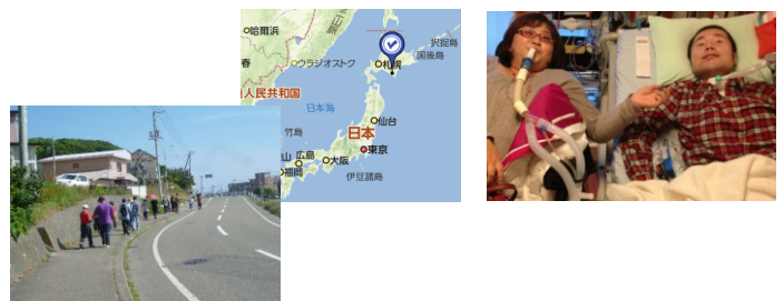
Left: Evacuation drills for tsunami at Urakawa. Right: Members in Zurayata Project